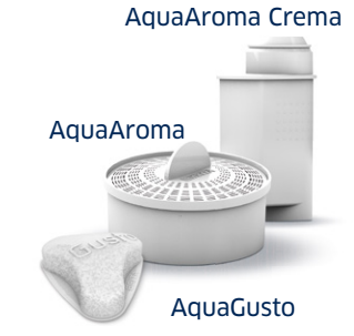
PURITY C1100 XtraSafe